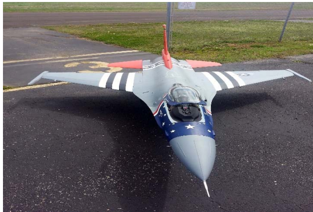
Another attempt was made later at Flite Fest with fuselage mods and paying close attention to proper CG.

In the end, the fuselage creates so much drag at higher angles of attack that the airplane cannot fly unless the fuselage is also at least close to being in the same flightline as the wing.